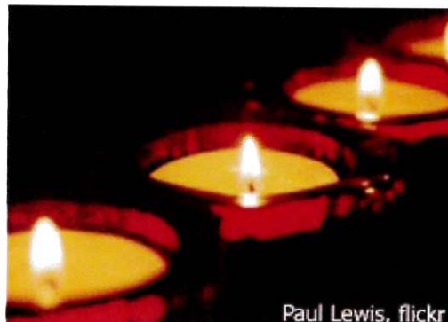
Paul Lewis, flickr

Deadline is June 9, 2017 Applications are online at www.pcusa.org/pda Please email all applications/references to PDA; Beth.Snyder@pcusa.org , 888-728-7228 Ext 5806 or FAX to 502-569-5704.